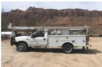
2007 Pulstar P12,000 Ford F-550 4x4 Diesel, 5 Spd. Man. Trans, 105,000 Miles...$55K.