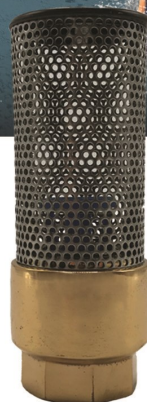
FLOMATIC ® ENVIRO CHECK FOOT VALVES