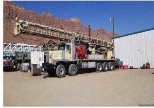
2004 IR T3W p/b CAT C-15, 1070/350 A/C, 60,000 Lb. Pull Cap...$275K