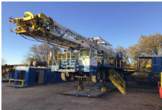
2007 Gefco /SS 185K-185,000 Lbs. Pull Cap. Substructure, Crewhouse ...$398K