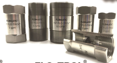
FLO-TROL ® FLOW CONTROL VALVES