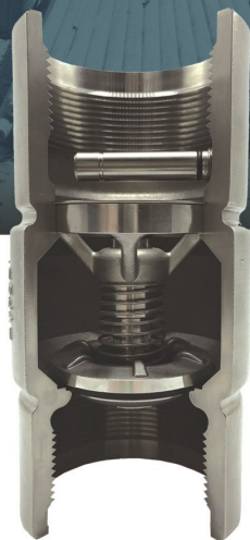
FLOMATIC ® SUBMERSIBLE VFD CHECK VALVES