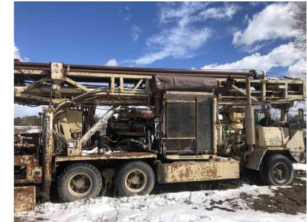
1982 IR T4W p/b Cumm. KTA 450, 900/350 A/C (Rebuilt)...$145K