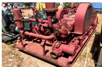
GD 5 1/2' x 8' Duplex Pump, p/b Detroit 471 w/ PTO Clutch, Skid Mntd...$28K