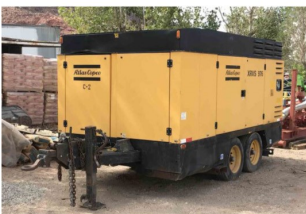
2005 Atlas Copco XRVS 976/365 PSI p/b CAT C-13, 7,535 Hrs...$52K