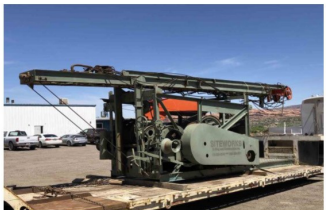
Bucyrus-Erie 60L Cable Tool (Bare) w/CAT 3054.. $31K