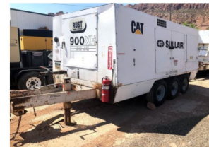
Sullair 900/350 A/C p/b CAT C-15, only 3,935 Hrs...$55K