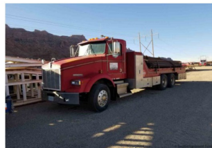
1994 KW T800 Flatbed Wtr. Trk, p/b Det. 60 10 Spd. Trans, 2000 Gal. Tank,550,000 Miles...$28K