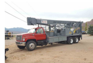
1992 Smeal R12 Special 44' Mast, 44,000 Lb. Pull Cap. Cat Engine...$115K