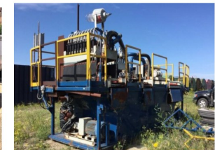
Tri-Flo 4,000 Gal. Mud System, 3=Shakers, 3= Cent. Pumps, Skid Mntd...$55K