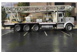
2014 Gefco 40K 1050/350 Air & 5 1/2x8 Mud, 2,450 Hr... $475K