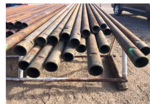
Several Sizes of Drill Pipe & Collars Available 2 3/8-11" O.D, 15, 20 & 30' Lengths!