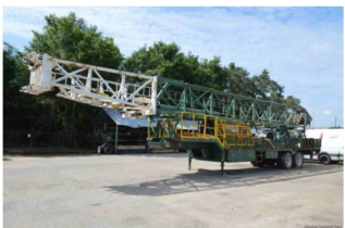
1978 Challenger 280 Drill Rig 52'x125,000 Lbs. Cap.. $195K