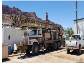
1989 Gefco 30K p/b CAT 3408, 900/350 A/C...$157K