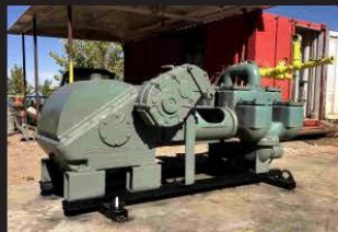
GD 7 1/2 x 8 Duplex Mud Pump...$36K