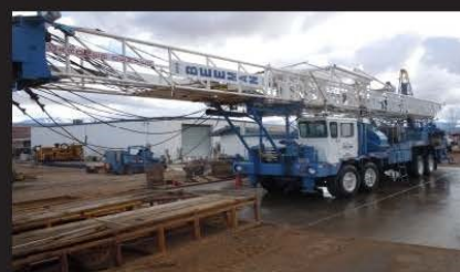
1977 Gardner Denver 2000 Drill Rig...$255K