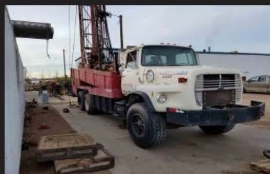
1989 Gefco Speedstar Newly Rebuilt A/C 30K....$225K

Phone: 435-259-7281 Email: info@beemanequipmentsales.com