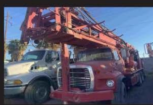
1989 Schramm T-660 Drill Rig... $225K