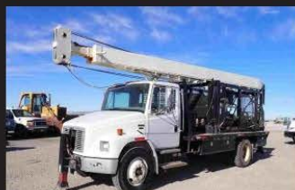
Semco S25000 Pump Hoist Rig...$217K