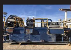
Tri-Flo Mud Mixing Sys- tem ...$65K