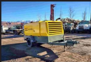
2012 Atlas Copco XATS750 A/C...$42K