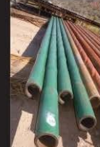
Several Sizes of Drill Pipe & Collars Available

Rigs · Compressors · Pumps · Mud Pits · Drill Pipe, Collars · Handling Tools · Trucks · Trailers and More!