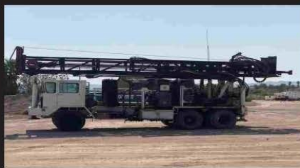
1990 Driltech D40K Drill Rig 60K Pull- back...$265