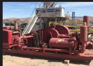
GD FDFXX, 5 1/2 x 8 Duplex Mud Pump...$28K