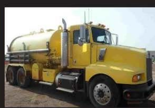
1986 Kenworth T800 T/A Vacuum Trk...$18,500