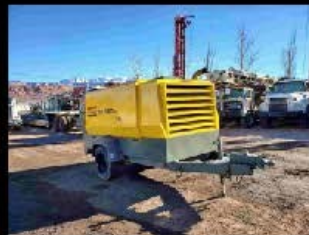
2012 Atlas Copco A/C, 1,941 Hrs, $42K