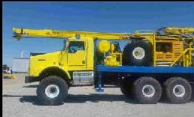
2015 Gefco Stardrill 300HD Drill Rigs (unused)...$645K