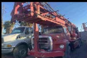
1989 Schramm T-660 Drill Rig... $225K