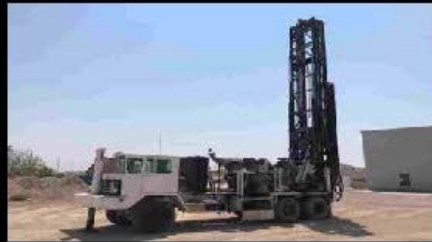
1990 Driltech D40K Drill Rig 60K Pull- back, Rebuilt in 2016..$265K