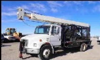
Semco S25000 Pump Hoist Rig...$217K