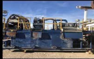
Tri-Flo Mud Mixing System ...$65K