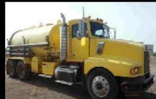
1986 Kenworth T800 T/A Vacuum Trk...$24K