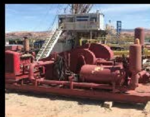
GD FDF00, 5 1/2 x 8 Duplex Mud Pump...$28K