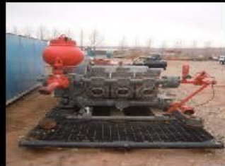
Ideco T-500 Triplex Mud Pump...$46K