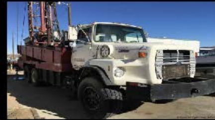
1989 Gefco Speedstar 30K Drill Rig, Mntd on Ford L8000....$175K