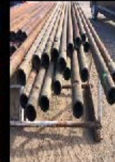
Several Sizes of Drill Pipe & Collars Available