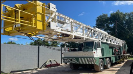
2004 Taylor RT4000 Drill Rig, p/b CAT recently rebuilt 2020...$585,000