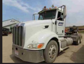
2011 Peterbilt 386 Trk. Cat 3306 Engine, 475 HP...$74,500