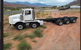
2007 Western Star 4900 Trk. p/b CAT C15, 6 cyl, 18 Spd. Trans... $77,500