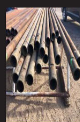
Several Sizes of Drill Pipe & Collars Available