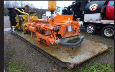
Tulsa Rig Iron MP680 Mud Pump p/b CAT C15 Engine, Low Hours...$127,500