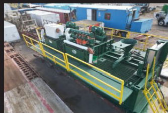
2009 Kem-Tron Tango 750- GPM Mud Rec. System... $127,500