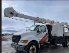
Smeal 10T Pump Hoist Mntd. On 2001 F-750 Trk...$87,500