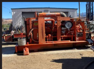
2005 Sullair 1350x350 A/C p/ b C-16 Engine, Low Hrs... $117,500