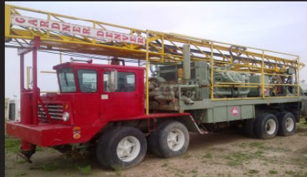
1973 Gardner Denver 15W p/b 350 Cummins Rig Overhauled...$187,500