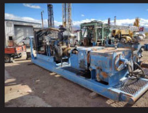
2007 S&K Triplex Mud Pump p/b Detroit Series 6 Cyl...$48,500