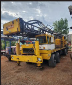
1978 SS-16 Speedstar p/b KT450 Cummins Rig, infield drilling 7/2023... $185,000