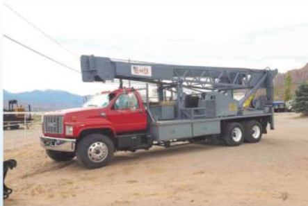
1992 Smeal R12 $127K