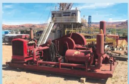
GD FDFXX 5- 1/2x8 $29,500.