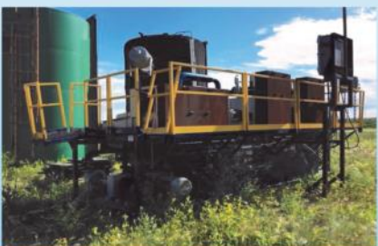
Triflo Mud System $ 69K