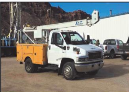
2004 Pulstar P10,000 $44K