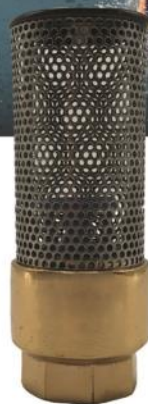
FLOMATIC® ENVIRO CHECK FOOT VALVES