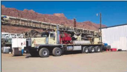
2004 Ingersoll Rand T3W $295K