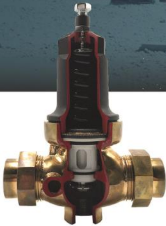
CYCLE GARD® CONSTANT PRESSURE PUMP CONTROL