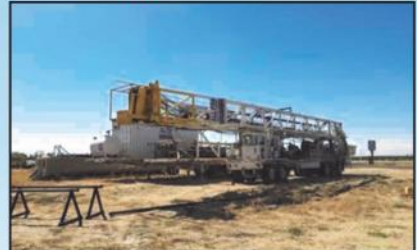
Challenger 320 Package $295K