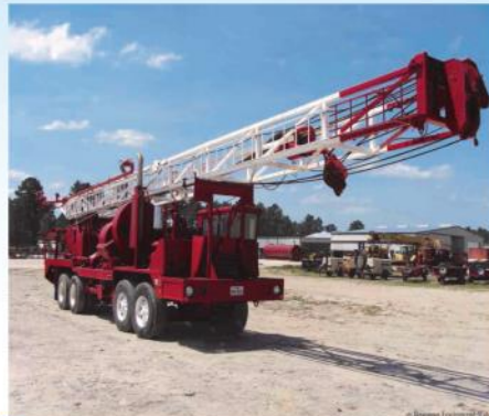
95 GD/2250 Midway(custom) $265K