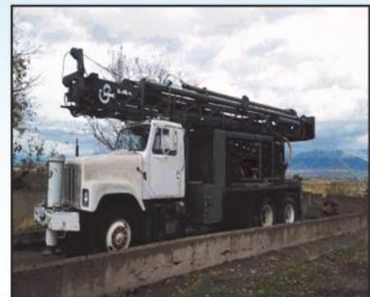
1985 CP 670 $69K