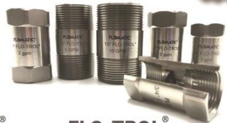
FLO-TROL® FLOW CONTROL VALVES