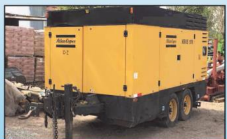
2005 Atlas Copco XRVS $62K