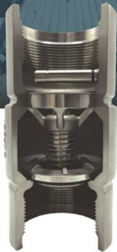
FLOMATIC® SUBMERSIBLE VFD CHECK VALVES