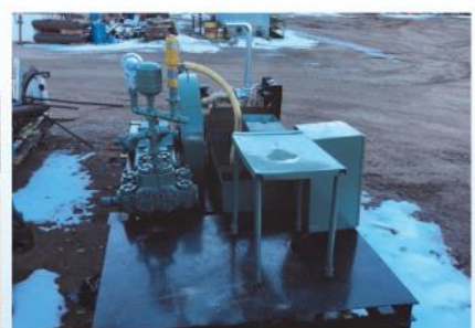
GD 5x6 Duplex Pump $26K