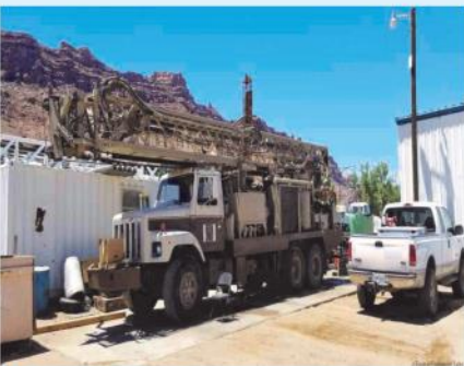
1989 Gefco Speedstar $175K